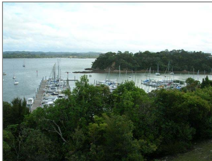
Doves Bay Cruising Club Marina

Water, fuel & Stores can also be obtained from Opuia's 240 berth Marina (phone 09-402-7124) or the 'touristy' Paihia. Te Hue Bay in Manawaora Bay has the best drinking water in the 'Bay', the wharf with the hose has 2.5 - 3 metres depth at high tide. At the entrance to the Kerikeri River lies Doves Bay the home to the Kerikeri Cruising Club & Marina (186 berths). Casual berths can be made by phoning 09-407-4757. The facilities here are excellent and the Club very welcoming.