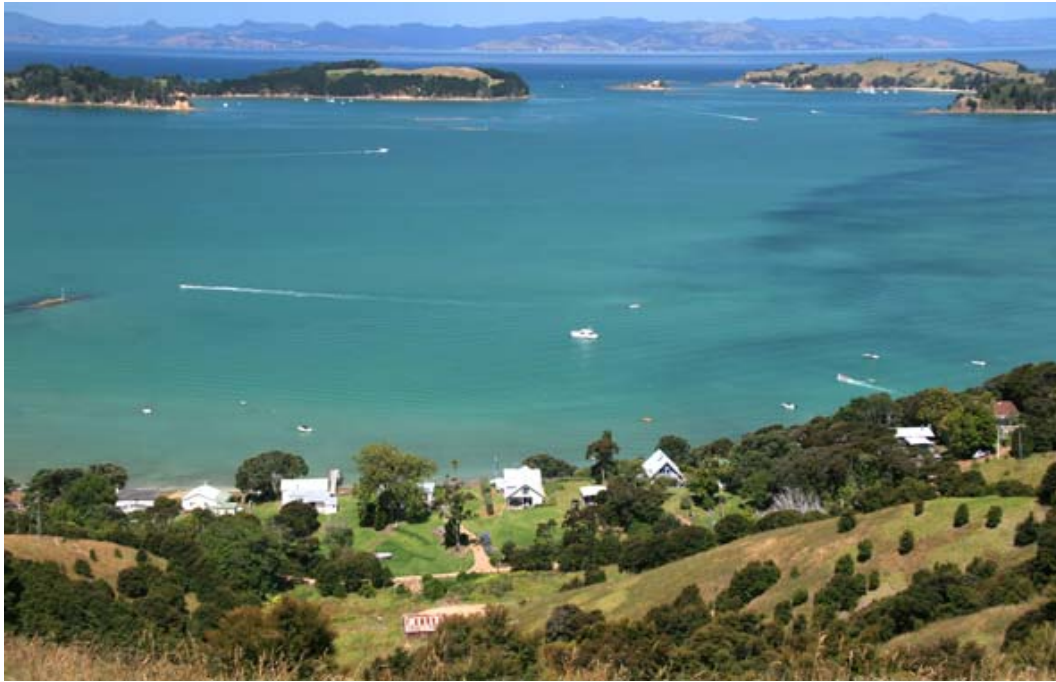
Arran Bay, looking towards Ponui Island and Coromandel

Waiheke Island's North Shore offers some of the best sand beaches of this coastline with the Eastern end of the island giving a wide range of protected scenic anchorages between Pakatoa and Ponui Islands. Northerly winds make the mangrove fringed Southern bays better with a vehicular ferry operating from Putiki Bay. At Matiatia Bay in the west is the 35 minute passenger ferry to Downtown Auckland.