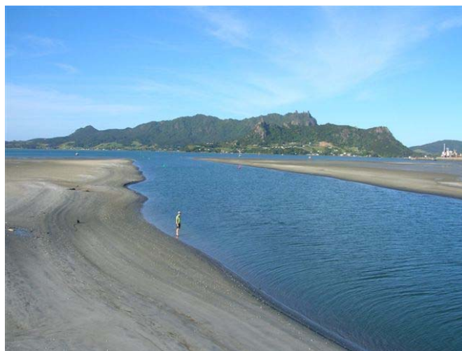
Marsden Cove Marina, dredged channel at low tide

At the entrance to The Whangarei River lies NZ's main oil refinery at Marsden Point. Just up river from the refinery is the busy logging port with the new Marsden Cove marina just up river from that. The channel to the marina is dredged to 3 metres with the first marks at 35°49'.9S 174°28'.4E. Phone 09-432-7740 for bookings.