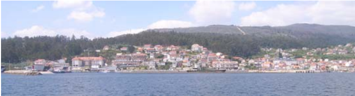
Combarro fishing Hbr HB