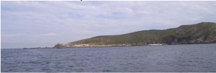
Enter well S to avoid reefs on the shoulders HB