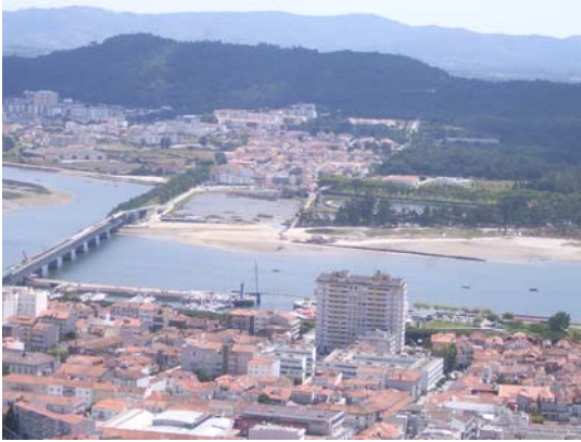
View of the marina entrance with footbridge in closed position HB