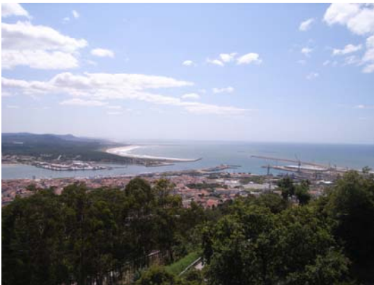
View of main harbour entrance from the heights above Viana do Castelo HB