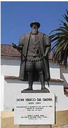
Vasco da Gama statue