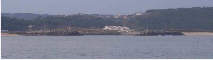
Nazare harbour entrance