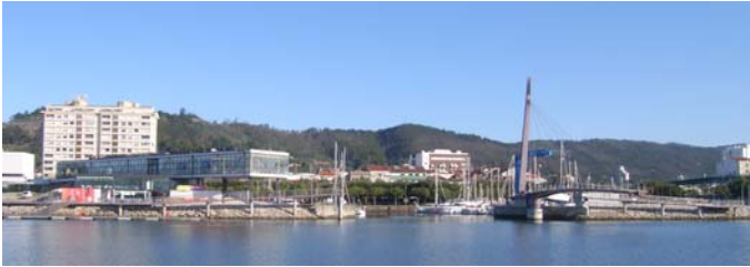
Marina entrance with waiting pontoon on the left and swinging footbridge in the open position HB