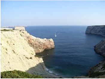
Secure anchorage Belixe HB