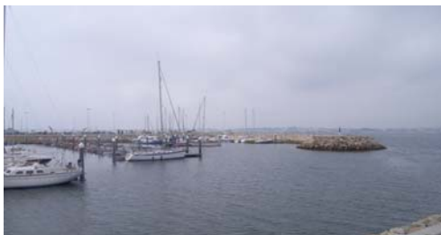
View from N mole looking SW