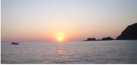
Fishing boat moorings HB