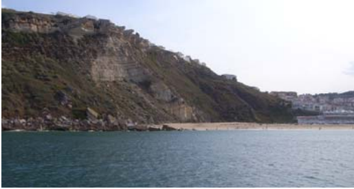
Nazare anchorage in 10m, good holding HB