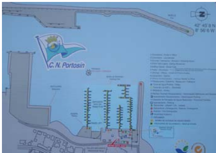
New pontoon layout