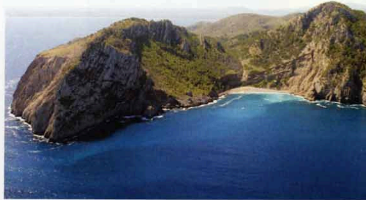
Playa de Coll Baix with Cabo Menorca looming left

cala plus a smaller one to the N. Cabo del Pinar is a military area, with landing in the calas forbidden and access sometimes restricted by buoys. Anchor in 5–7m (less if it is permitted to enter the calas) over sand and weed. Holding is patchy. It is a popular place for day visitors from Pollensa and can become crowded.