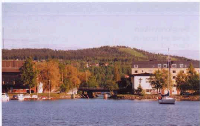
Härnösand, looking south-southeast towards the bridge from the western corner of the inner basin F. and G. Cattell

There is a large shopping centre spread across both banks of the fjord, a university and multi-faith cathedral.