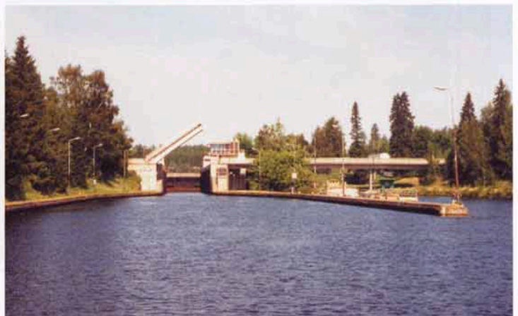
Approaching a lock on the Saimaa Canal

See Vyborg (page 279) for the approach to the canal. A Russian visa is not necessary unless Vyborg is to be visited.