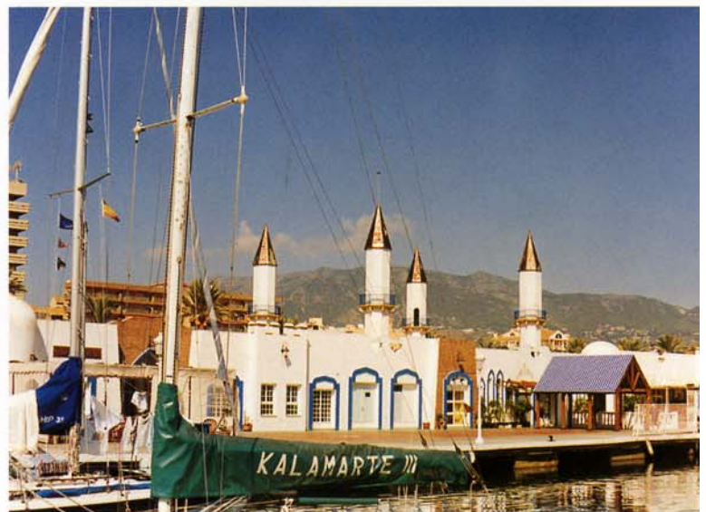
The minarets at Fuengirola

Rail and bus service. Airport at Málaga. ☎ Area code 95. Taxi ☎ 247 10 00.