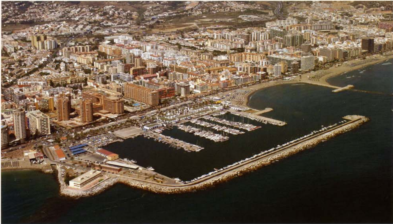
Fuengirola. Note submerged breakwater running SE from groynes to NE

From the NE The massive high-rise tourist development around Torremolinos continues with minor interruptions along the coast as far as Fuengirola after which it peters out.