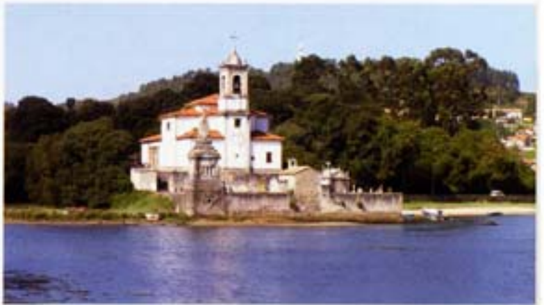
The imposing church on the S bank