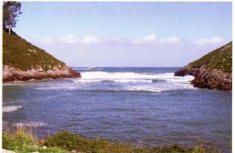
The bar near LW looking N. Isolete Peyes on left beyond