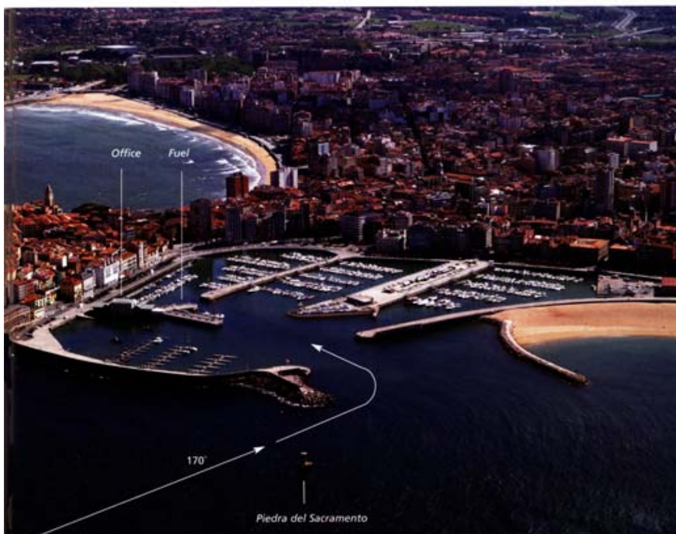
Gijón marina looking SE

Radio Ch 09 Marina (Spanish only) Telephone Marina ☎ 34 985 34 45 43 www.puertogijon.es